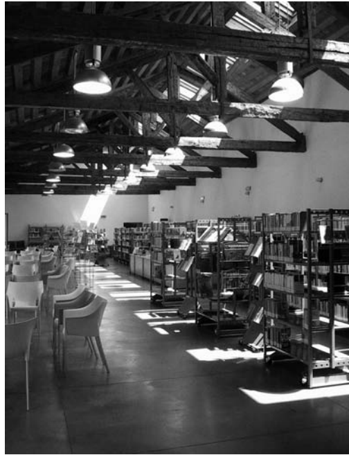
Illustration 4: New public library of Pesaro (D. Guerri)