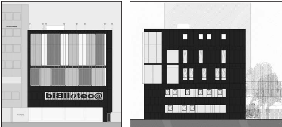
Illustrations 7 and 8: New library of Meda, Milan (alterstudio partners)

One last case I would like to describe is another project my office is working on, the new library of Meda (Milano), which involves the re-use of an ugly existing building, of no worth, but which had the advantage of occupying a central position, opposite the building where the library is currently housed, as well as belonging to the municipality.