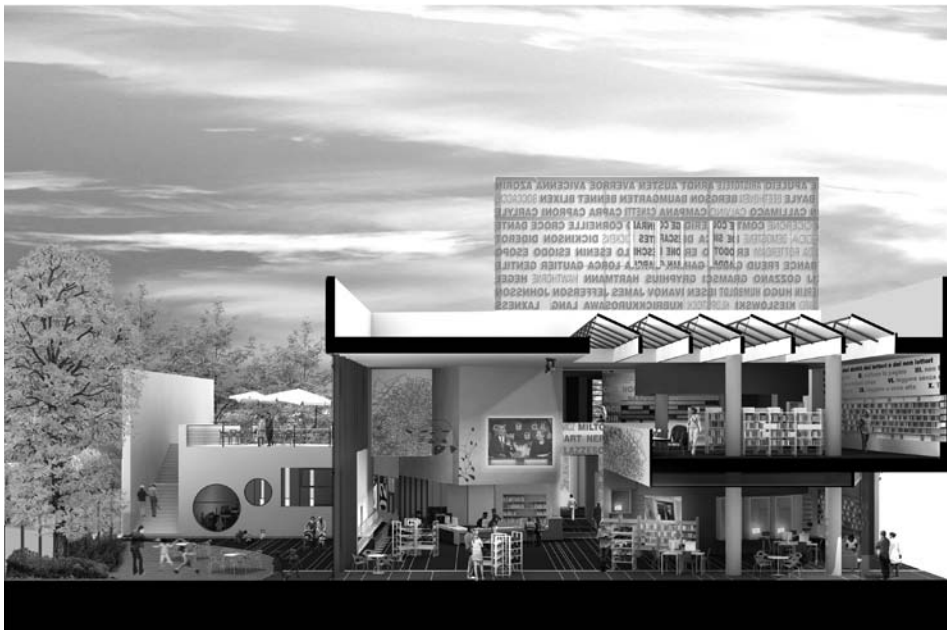
Illustrations 2 and 3: New library of Samarate, Varese (alterstudio partners)

The building complex consists of the compact body of the auditorium (with a glazed foyer overlooking the street and a stage which can be opened to the outside for use in the summer) and that of the library, more articulated. The architecture of the building plays on the contrast between full and empty, light and dark, the smoothness of