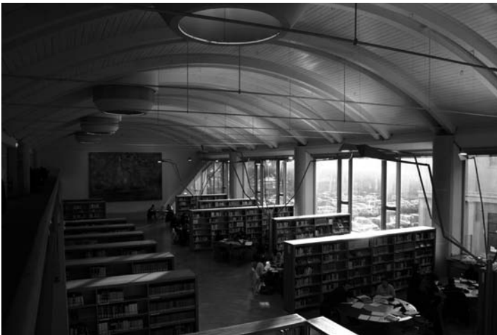
Illustrations 5 and 6: New library of Pistoia (Pica Ciamarra Associati)