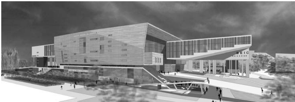
Illustration 1: European Library of Information and Culture, Milan (Bolles+Wilson, Alterstudio partners, AHW)

The latter is a project which my office itself (alterstudio partners srl, Milano) is working on, together with the German Bolles+Wilson GmbH of Münster.